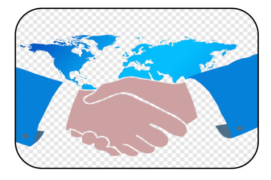
3. THIRD COUNTRY TRAINING PROGRAMME