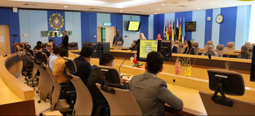
Strategies in Producing Halal, Safe & Effective Natural Bioactive for Cosmeceutical Applications by SIRIM