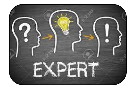
5. DESPATCH OF EXPERTS (DoE)