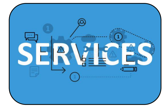
6. PROFESSIONAL ADVISORY/SERVICES